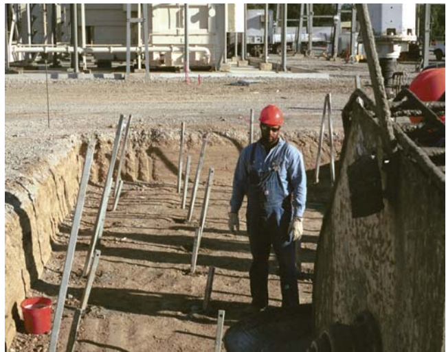
(A.B. Chance, a Division of Hubbell Power Systems, Inc.)