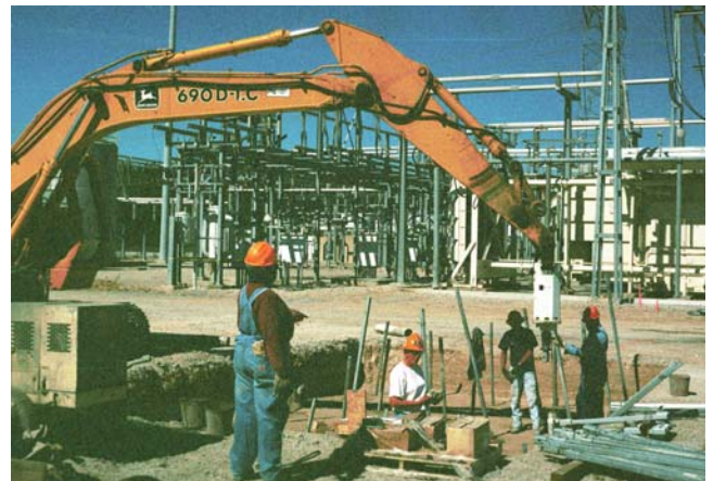
(A.B. Chance, a Division of Hubbell Power Systems, Inc.)

NOTE: Because Hubbell has a policy of continuous product improvement, we reserve the right to change design and specifications without notice.